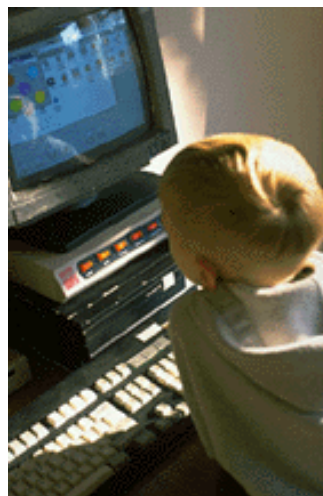
It will be their world someday!

Another caution to observe is if the material to be used has valuable content, it is best to reapply the content (cut & paste) on your webpage because the link may go “sour” to an error condition because it has been removed from the original site. Then you have lost it all.